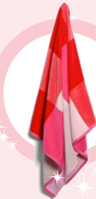
CANNINGVALE LOTTIE BEACH TOWEL A thick velour finish allows for a soft silky touch to the fashionable summer coloured towel with bold block grid arrangement. 86 x 160cm