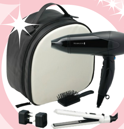
REMINGTON POWER PRO TRAVEL KIT Jet set with confidence with this convenient travel kit to keep your hair perfectly styled while you're home and away.