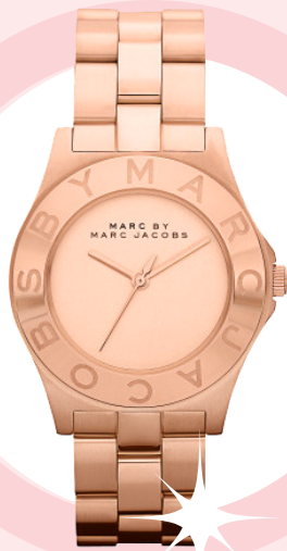
MARC JACOBS BLADE WATCH

Statement rose gold turnlock hardware with a shiny patent leather finish. This classic carryall effortlessly combines form with function. A collectible classic. 21 x 37 x 18cm