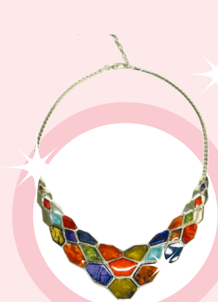
KALEIDOSCOPE NECKLACE Dare to make a statement - the silver rhodium plating with bright coloured enamel shapes define the distinctive on-trend style.