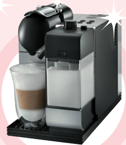
NESPRESSO DELONGHI LATTISSIMA CAPSULE MACHINE

The standard-setter in tablets... With a new A7 chip, advanced wireless and powerful apps, all integrated with iOS7, the mini with 7.9 inch retina display lets you do more than you ever imagined.