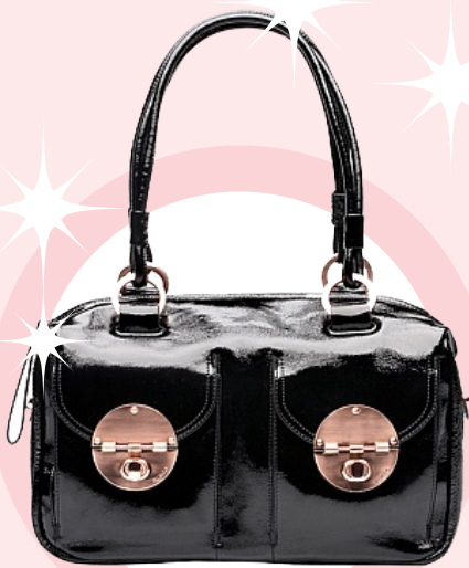
MIMCO PATENT TURNLOCK ZIP TOP HANDBAG

Statement rose gold turnlock hardware with a shiny patent leather finish. This classic carryall effortlessly combines form with function. A collectible classic. 21 x 37 x 18cm