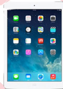
APPLE iPad MINI

The standard-setter in tablets... With a new A7 chip, advanced wireless and powerful apps, all integrated with iOS7, the mini with 7.9 inch retina display lets you do more than you ever imagined.